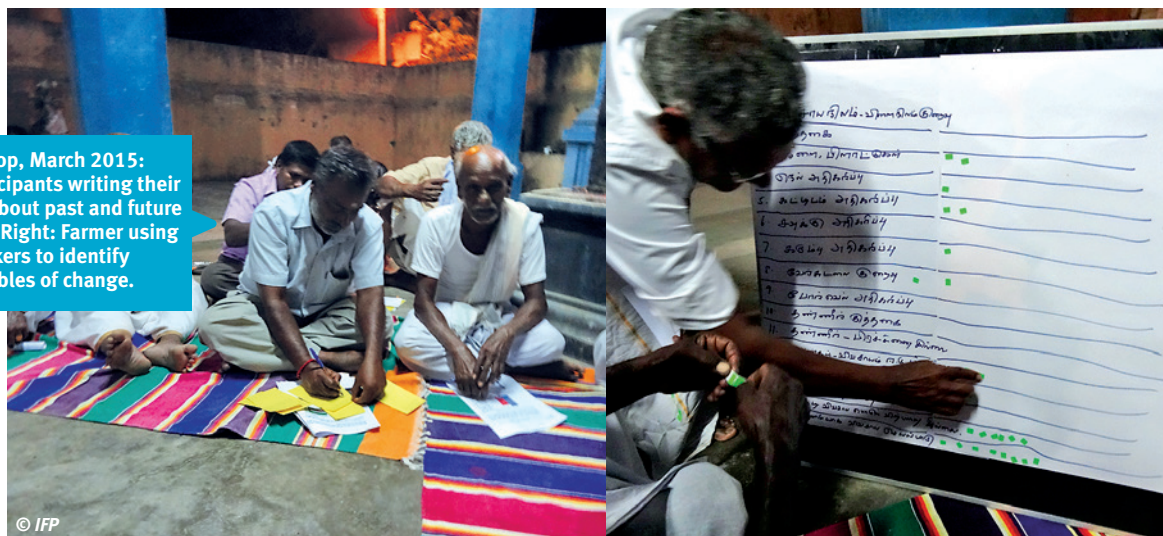
① Workshop, March 2015: Left: participants writing their opinions about past and future changes – Right: Farmer using green stickers to identify main variables of change.

would still be alive and climate change would already have played a role. From the prospective scenarios presented, the farmers could prepare their own scenario. The scenarios were discussed in April 2015 (Picture ②) with ten farmers from the Tank Users Association (TUA), a local institution that is liable to support local adaptation to climate change. After the first workshop, the members of this association were interested in going a step further in the process while requesting support to update their strategy. According to the TUA rules in Pondicherry, the TUA board also includes a woman, Scheduled Castes 5 and landless laborers.